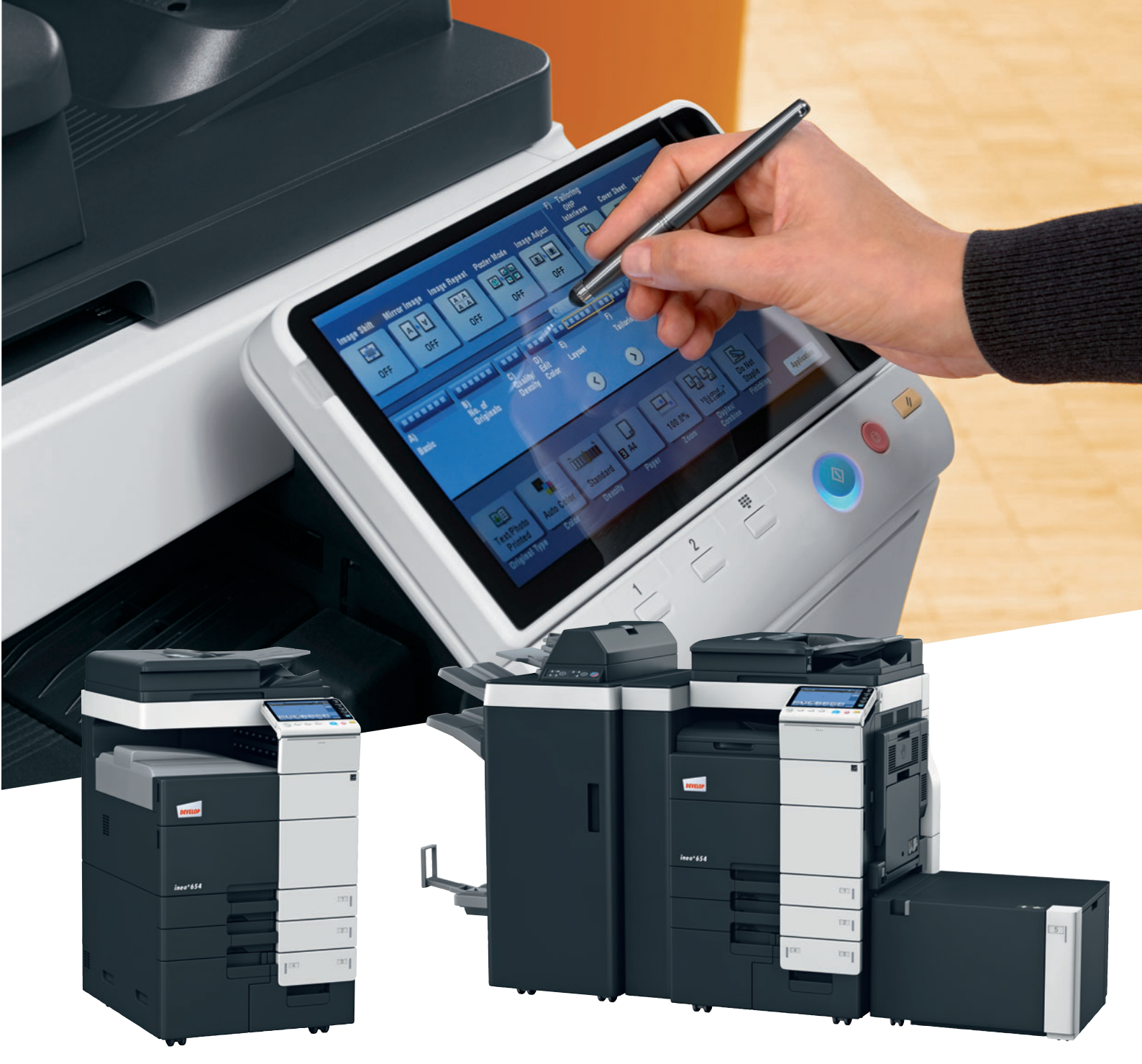
ineo+ 654 with output tray (OT-503)