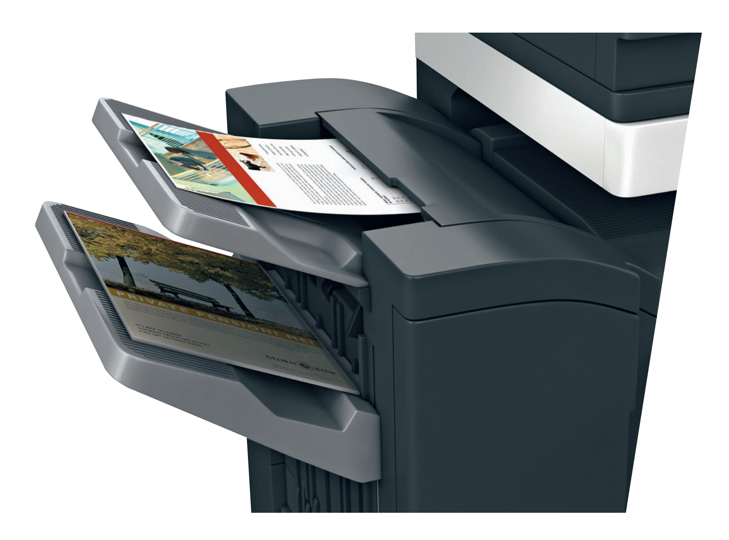
ineo+654 – your in-house production system

With the optional Fiery controller the ineo<sup>+</sup> 654 offers you significantly more possibilities in colour management – because both controllers, the standard ineo controller as well as the Fiery controller, can be used parallel. While the ineo controller handles everyday office documents, the Fiery controller is available for more sophisticated colour management tasks, e.g. with ICC Profile support, to ensure digital documents and printouts are perfectly synchronised.